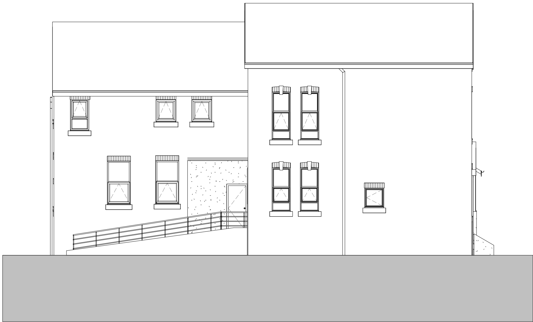
West Elevation as Existing 1 : 100