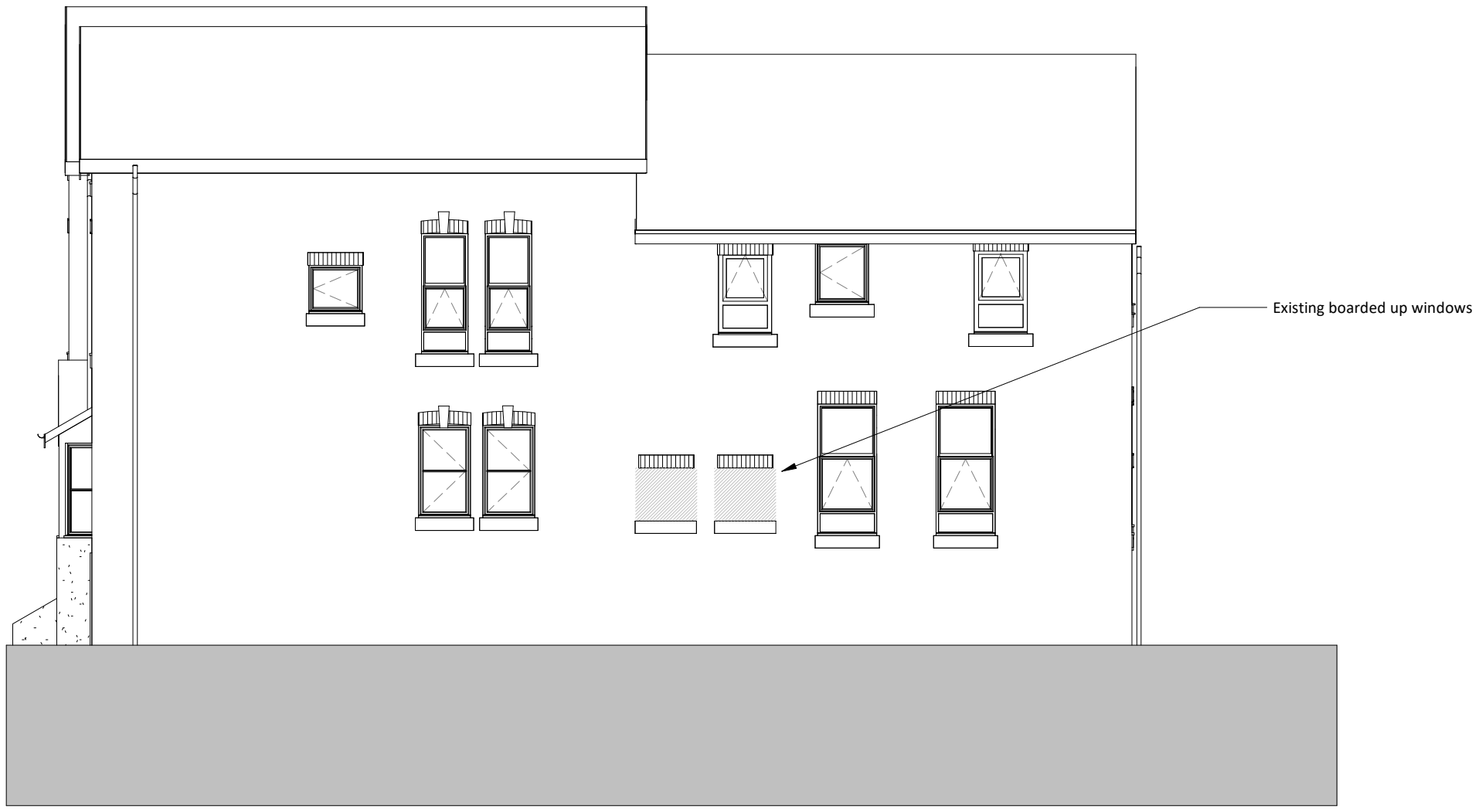
East Elevation as Existing 1 : 100