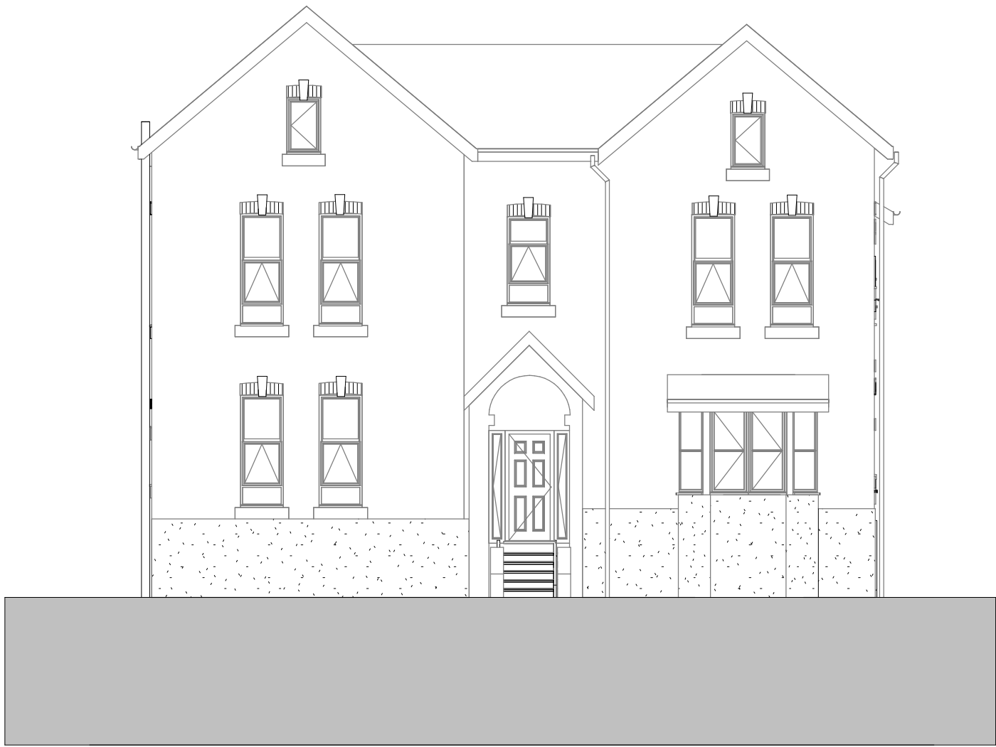
South Elevation as Existing 1 : 100