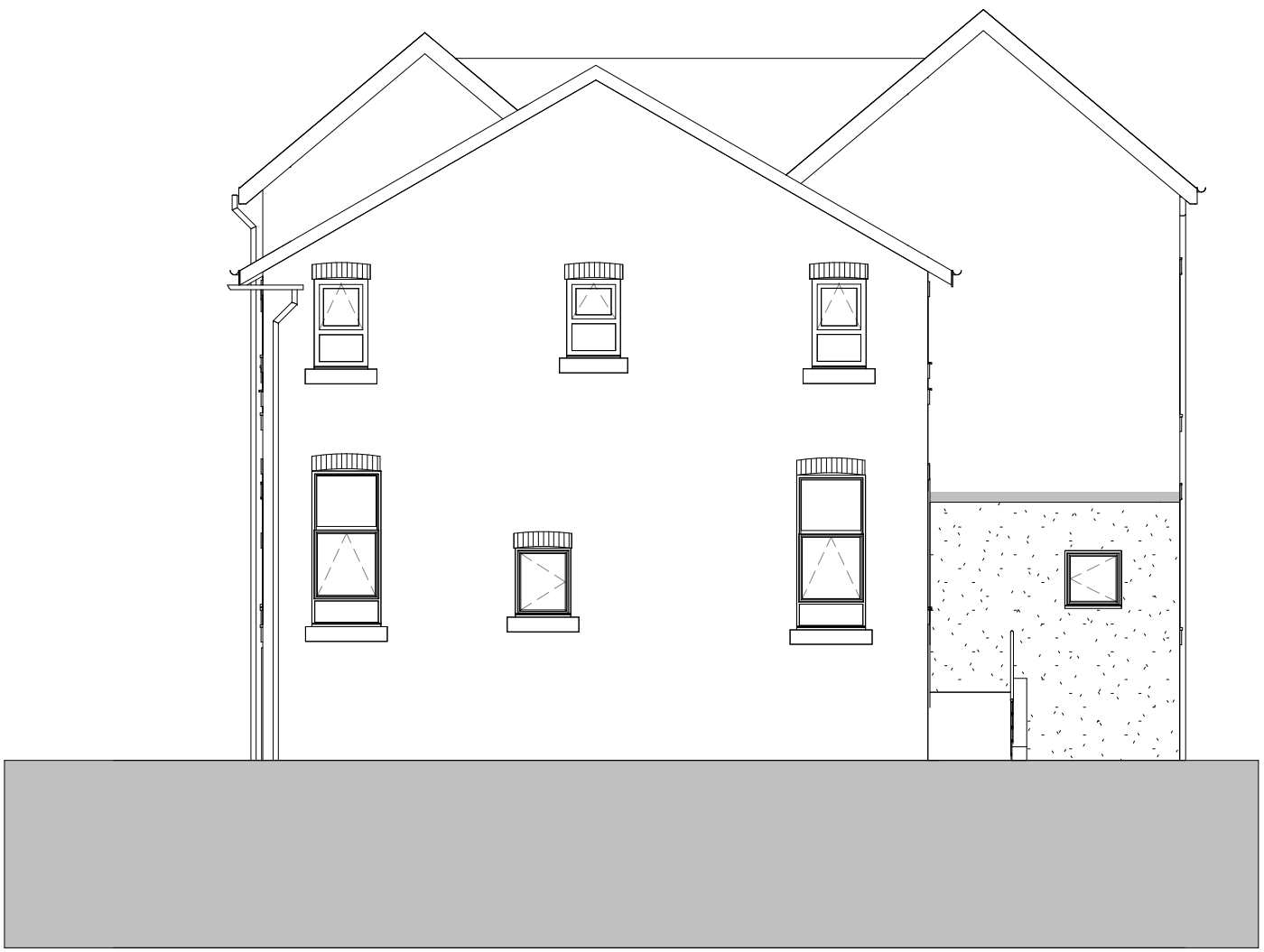
North Elevation as Existing 1 : 100